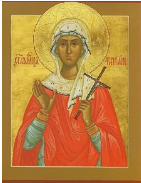
MARTYR TATIANA OF ROME